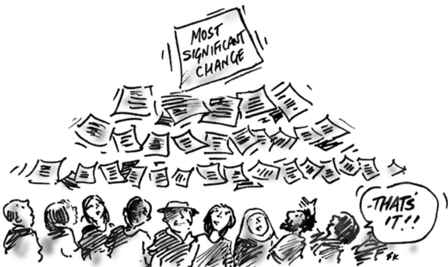
A panel of designated stakeholders discuss "significant change" stories emanating from the field and define what the "most significant change" is.