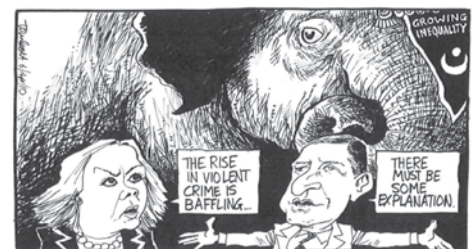
Tom Scott cartoon from Waikato Times Weekend 10 April 2010 http://fairfaxmedia.newspaperdirect.com/epaper/services accessed 11.4.2010